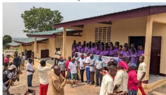
Protestant High School, Bouar-CAR

Sustainability of programs is a priority of the leadership of the ELC-CAR. The church and partners have done a wonderful job sharing the Good News of Christ and bringing needed support and care to people in the Central African Republic. Substantial support from the ELCA and other international partners of the church has made much of this possible.