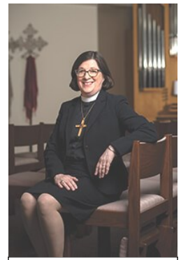
From the Presiding Bishop Eaton